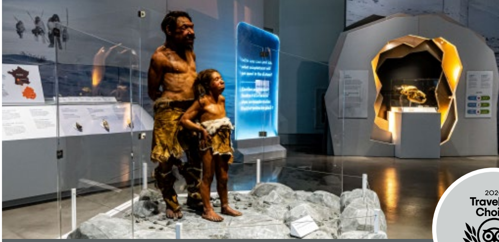
Special Exhibition (summer 2022): Planet Ice: Mysteries of the Ice Ages